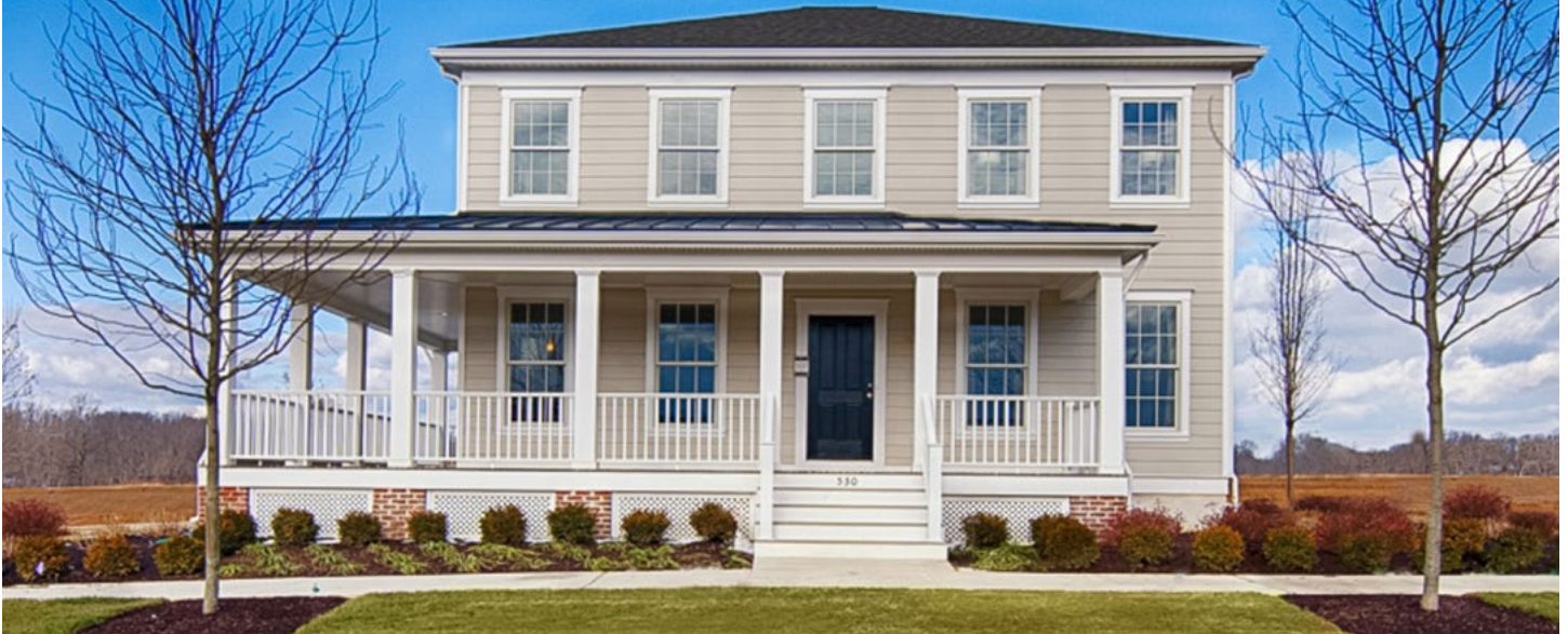
The 4-bedroom Edmonston model home opens today for a special preview at The Town of Whitehall.

T ucked along the south bank of the C&D Canal, construction of a new, contemporary approach to small-town values is coming to life in the form of The Town of Whitehall. Now, you'll have the opportunity to experience Benchmark Builders' interpretation of hometown living with the opening of the newly completed, fully furnished Edmonston model, a 4-bedroom home with a unique combination of charm and sophistication.