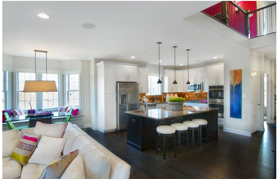
Thoroughly modern, open-concept floor plans create a remarkably airy living space.

For more information, call 302-376-8699. For floor plans and construction details, visit BenchmarkBuilders.com .